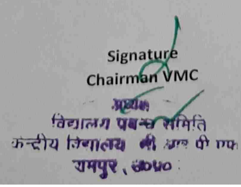
Signature Representative of Chairman VMC